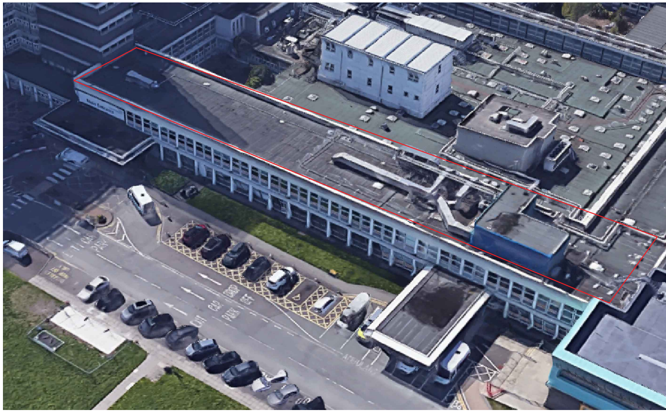
WARD 6 LOCATION PLAN